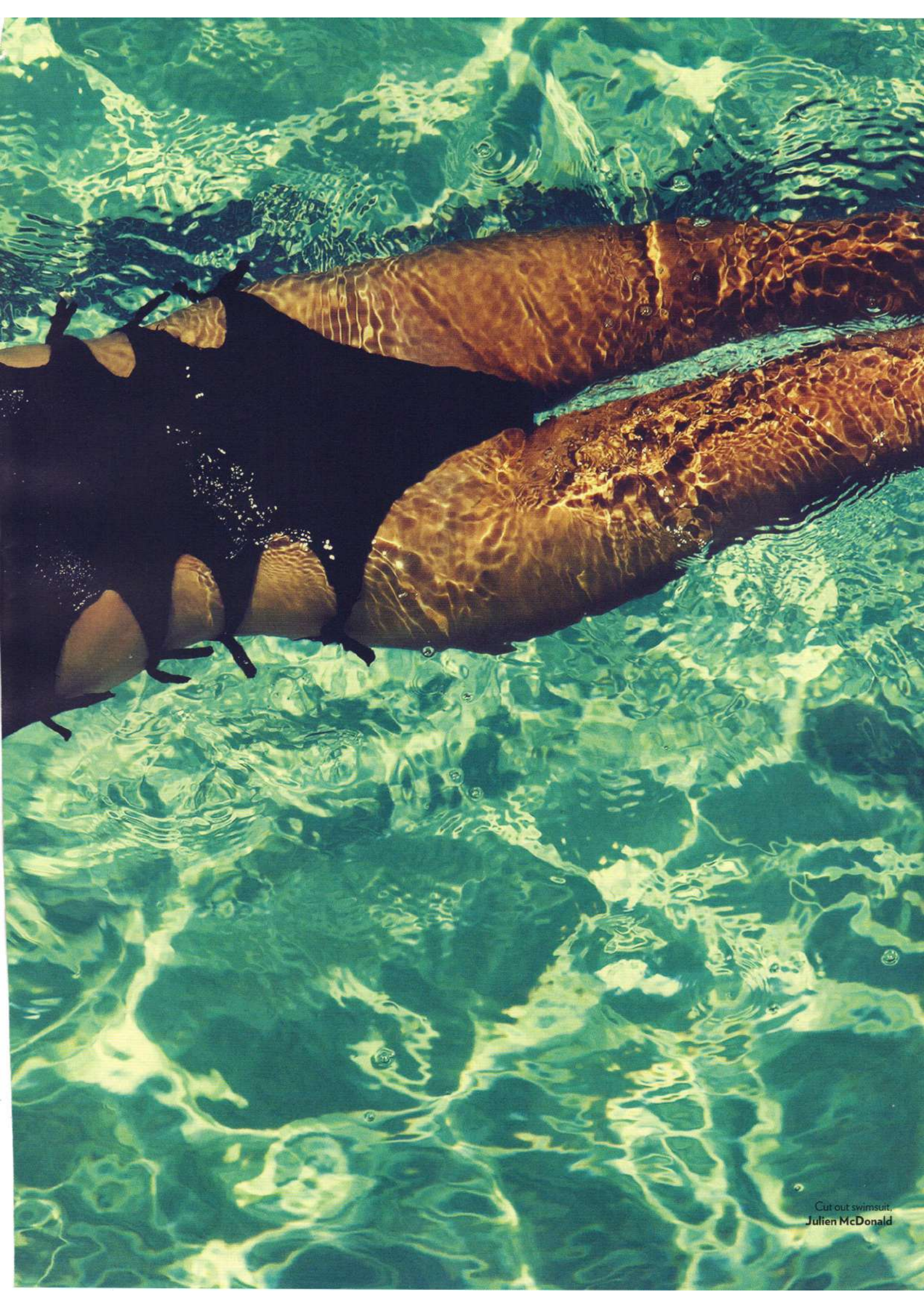
Cut out swimsuit, Julien McDonald