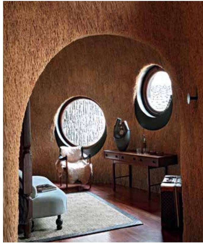
6 / The Nest, Sossusvlei, Namibia (above left) Just a few years ago, conservationist Swen Bachran and artist Porky Hefer collaborated to weave together a spot that will delight both design fundis and nature enthusiasts. The sociable chambers of this idiosyncratic guest lodge are peppered with portholes that frame different captivating views of the Namibian landscape. The trimmed hatch offers a cool shelter from the harsh conditions, while the eclectic interiors delight with a collection of iconic pieces by celebrated South African designers. @perfecthideaways