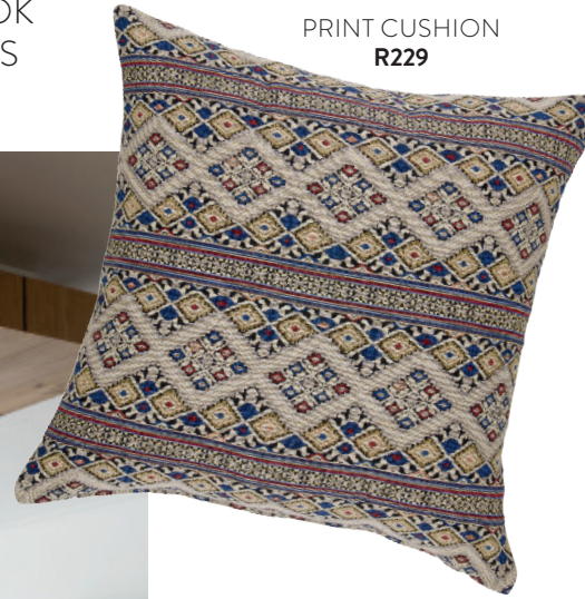
PRINT CUSHION R229