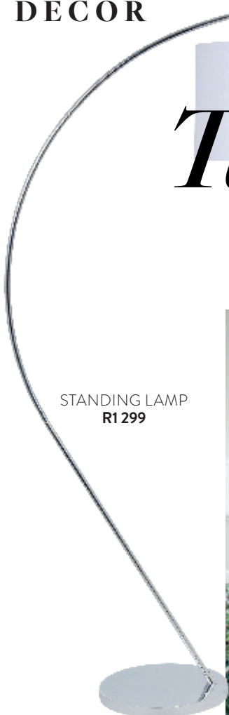
STANDING LAMP R1 299

RECREATE THIS CONTEMPORARY LOOK WITH OUR FAVOURITE DECOR PIECES