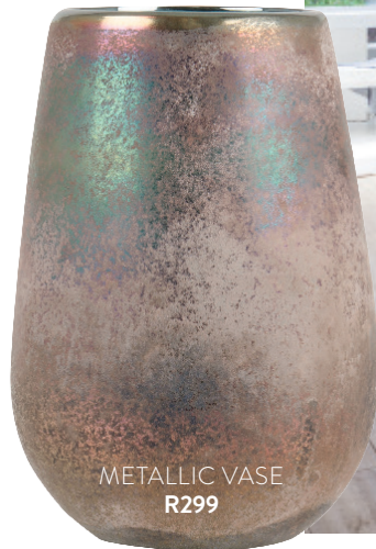
METALLIC VASE R299