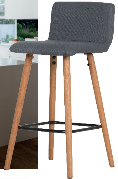
GREY STOOL R1 899