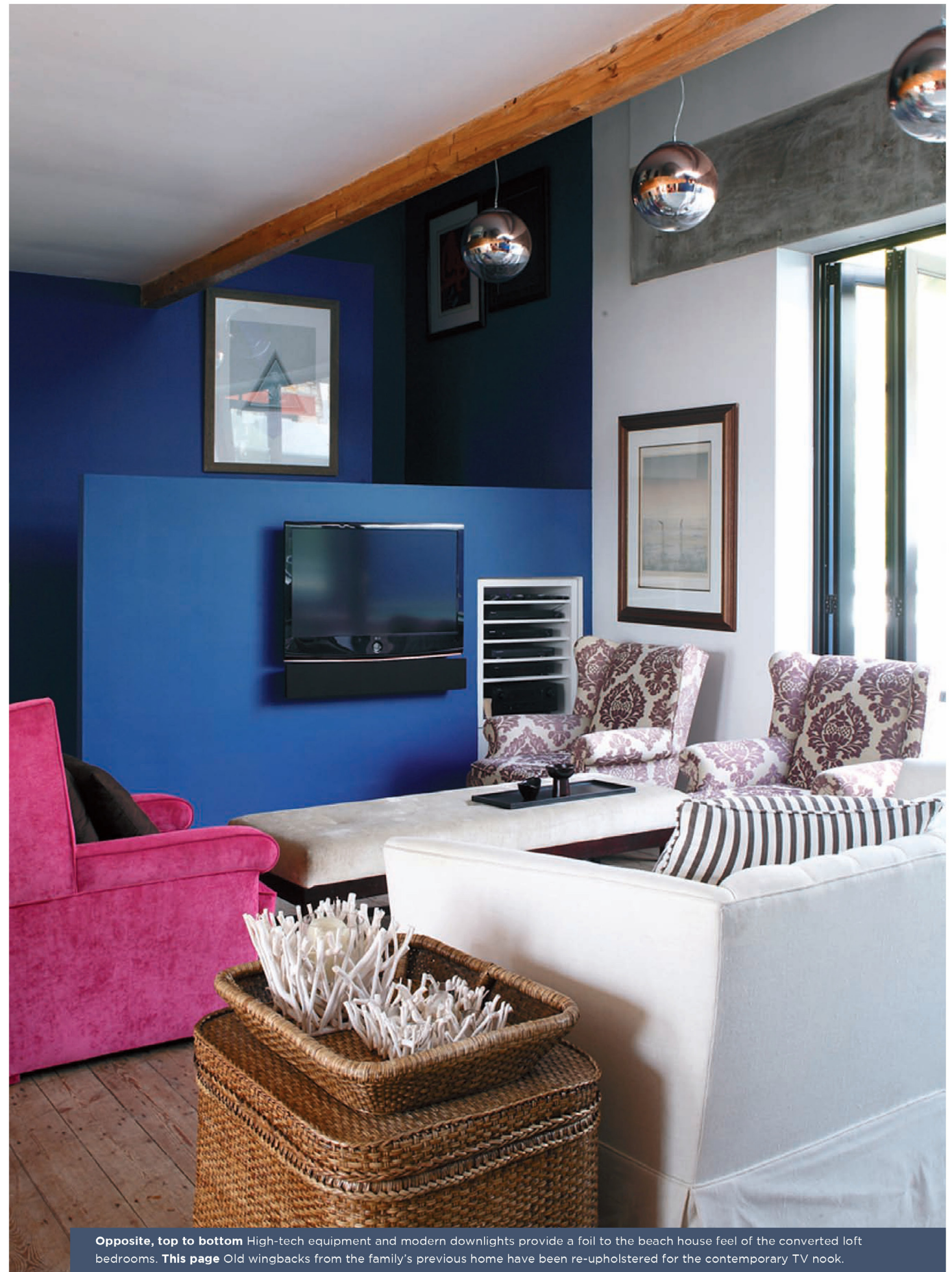
Opposite, top to bottom High-tech equipment and modern downlights provide a foil to the beach house feel of the converted loft bedrooms. This page Old wingbacks from the family's previous home have been re-upholstered for the contemporary TV nook.