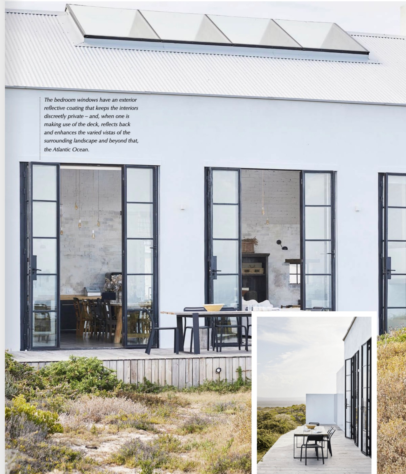
The bedroom windows have an exterior reflective coating that keeps the interiors discreetly private – and, when one is making use of the deck, reflects back and enhances the varied vistas of the surrounding landscape and beyond that, the Atlantic Ocean.