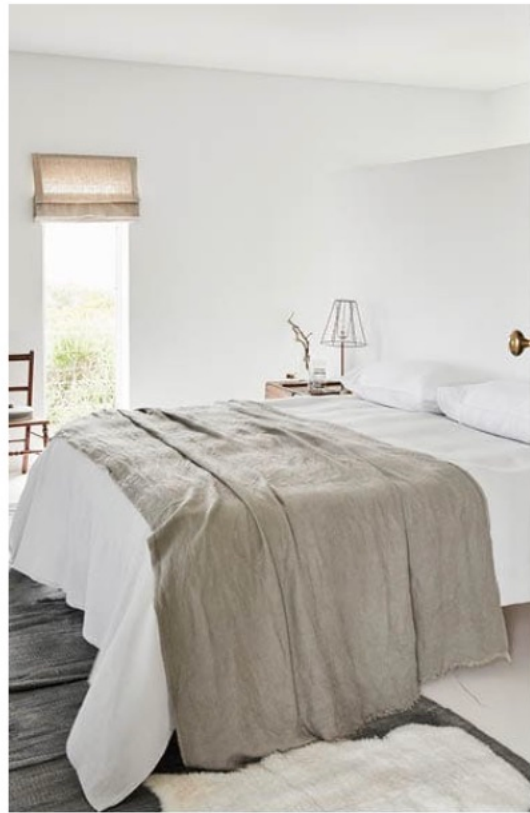
The bedrooms are both spacious and tranquil, and are simply but cosily furnished with king-size beds clad in linen from Hertex Haus ( hertexhaus.co.za ). The bed cover is from The Fabric House ( thefabrichousect.com ), the cotton rugs are from Weylandts ( weylandts.co.za ). The window seats are home to a selection of cushions from Gister ( facebook.com/gistervintagedecor ) and throws from Weylandts ( weylandts.co.za ).

and black – it might be tempting to characterise Evi’s style as minimal in its ethos, she declares that it definitely isn’t: “I’m monochromatic, not minimalist,” she says decisively.